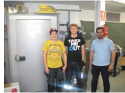
Savo Students, developing projectX at Xabec

Brochures produced in France and Turkey are presented to the partners, as dissemination materials.