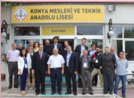
Visiting the school

Cedefop is one of the EU's decentralised agencies. Founded (1) in 1975 and based in Greece since 1995, Cedefop supports development of European vocational education and training (VET) policies and contributes to their implementation. The agency is helping the European Commission, EU Member States and the social partners to develop the right European VET policies.