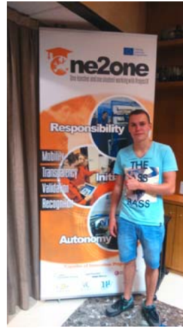
Sustainability, an student from a Dutch school not included in the TOI project, has developed a ProjectX at Xabec

"It is better to have one person working with you than three people working for you."