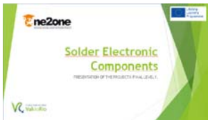
Val Do Rio ProjectX PPT.