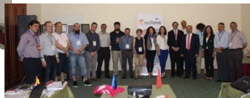
Farewell group picture