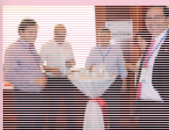
Short break during the work