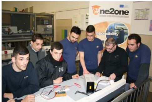
Pitesti group of students developing ProjectX at Xabec