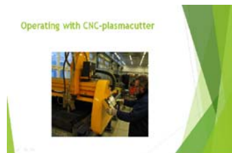
Savo ProjectX PPT.